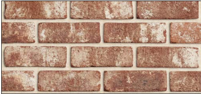
FACEBRICK - PGH - SANDSTOCKS BALMAIN TO EXT. WALLS