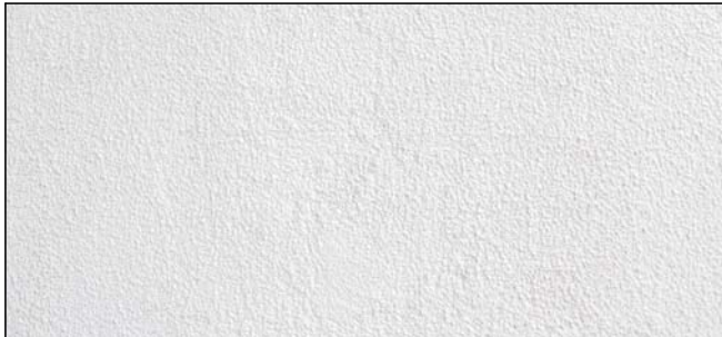
WHITE RENDER TO EXT. WALLS