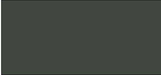
COLORBOND WOODLAND GREY - METAL DECK ROOF