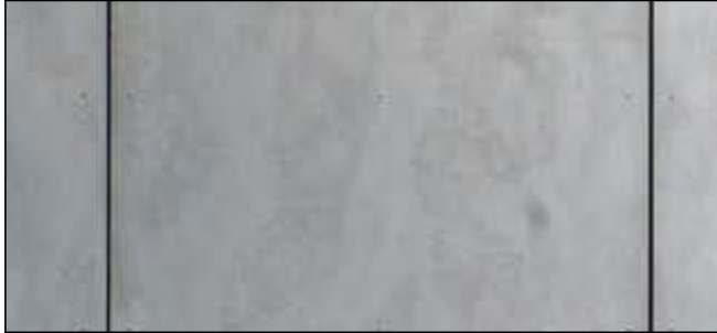
CEMINTEL CLADDING TO EXT. WALL. & FEATURE BLADE WALL